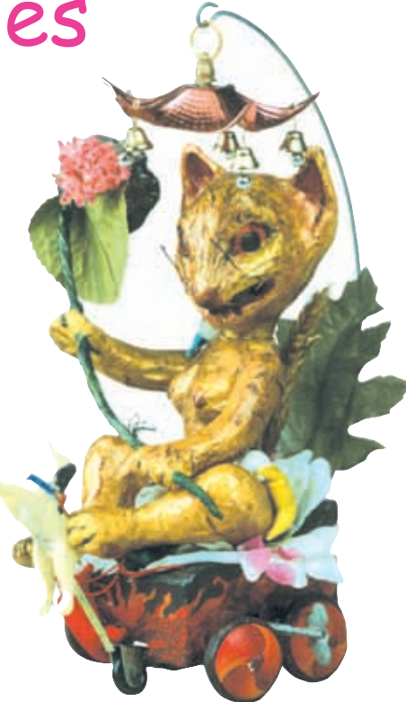
Haruko Okano (Canada)/ Kitsune/Inari. From the collection of WOMEN beyond borders.

You can see over 200 boxes that carry special messages from all corners of the earth by visiting the University Art Museum at UCSB through December 15. Visit www.womenbeyondborders.org to learn more about the WOMEN beyond borders project.